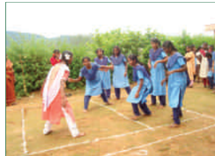
Girls Playing Kabadi, a famous game in South India Girls' Home, Valparai, Tamil Nadu

Apart from their studies, they participated in games and sports, several quiz competitions, and talent development programs conducted in their schools and other institutions; some of them won prizes.