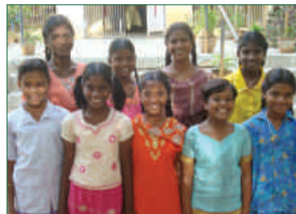
"We are fortunate residents of this Home." Girls' Home, Kollagunta, Andhra Pradesh

I take this time to reflect on the last academic year and plan for the next academic year which starts in June 2010.