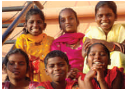
"Oh! We just love our Home." Home of Hope for Street Girls, Bangalore, Karnataka

For the next academic year, we would like to focus on their career development. We have plans of conducting career guidance programs from time to time to encourage and motivate them to score high marks which would enable them to qualify for competitive examinations ultimately helping them choose their career.