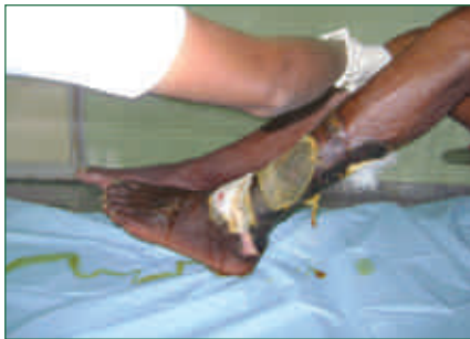
Emergency Unit DJM CM Hospital, Peyanapalli, Andhra Pradesh

Several poor and needy patients, young and old, who could not afford medical treatment, were provided free treatment.