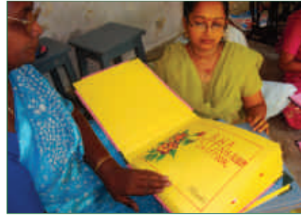
Time for submission of Albums Skills Training Center, Chittoor, Andhra Pradesh

women proved very successful empowering the women to become self-reliant.