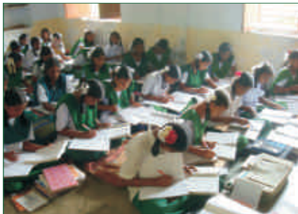
Children busy preparing for Exams Girls' Home, Kollagunta, Andhra Pradesh

As I write this column, all our children have just finished their Annual Exams and have gone for their summer holidays. They had a very challenging 3-month-term in school after their Christmas vacation preparing for their Annual Examinations – School and Board examinations besides striving hard to give their best in making a good presentation of their School Projects.