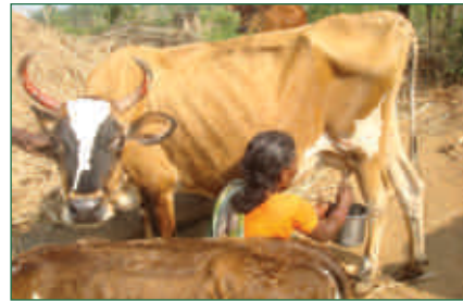
Cow says, "Ambaaaa..." Rural Cow Society, Anagallu, Andhra Pradesh

"Ambaaaa...!" - one of the cows of the Rural Cow Societies expresses its joy for having got an opportunity to be part of a family and have someone to care for it.