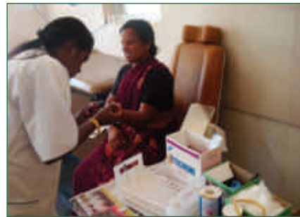
Blood Chemistry Laboratory DJM CM Hospital, Peyanapalli, Andhra Pradesh

We are currently facing financial problems which is affecting the smooth running of the Hospital. We have an urgent need to get the Hospital going, do partner with us through your valuable contribution.