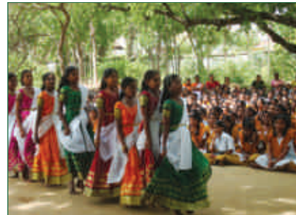
Dance performance - Talent Development Girls' Home, Chittoor, Andhra Pradesh

In the entire academic year we had focused on children's academic education, physical and talent development activities. Our children have done fairly well in their studies.