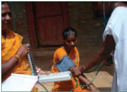
General Health Camp - Community Outreach Program DJM CM Hospital, Peyanapalli, Andhra Pradesh

Many people who could not make it to the Hospital for treatment have been benefited by these rural Camps.