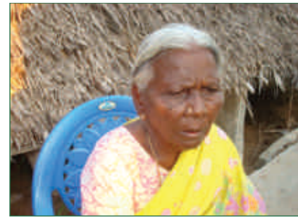
Beneficiary of "Assistance to the aged" Project Chittoor, Andhra Pradesh

Care for the elderly has been a concern of the SAC-CCC. We are happy to reach out to more than 20 deserving senior citizens through this project.