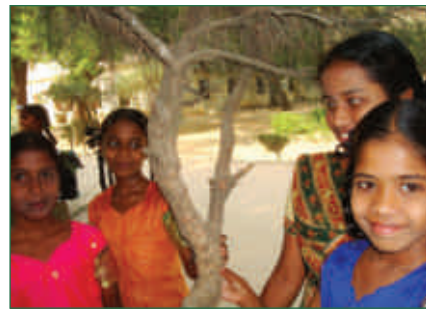
"What a relief after exams!" Girls' Home, Chittoor, Andhra Pradesh

Finally, the testing time for them came to end and their cheerful time began. Children kept the telephones in the projects busy calling their families and loved ones to make plans for their summer holidays. The child care staff at the projects were happy to witness the children's joy and excitement before they left for vacation.