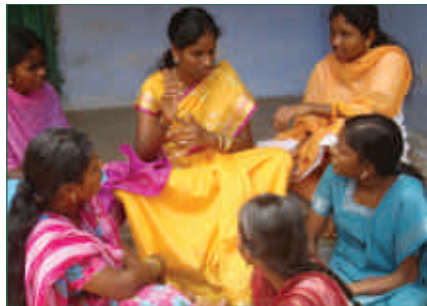
"Counseling" - by the Child Care Worker Girls' Home, Dharapuram, Tamil Nadu

To achieve this, we will have child friendly guest speakers, information pamphlets, and follow-ups, but all these require increased man power and money. This is where we invite you to get involved.