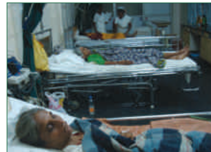
Female Ward, DJM Christian Mission Hospital, Peyanapalli, Andhra Pradesh

At present, 25 beds have been commissioned.