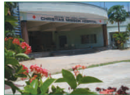
DJM Christian Mission Hospital Peyanapalli, Andhra Pradesh

The Devanbu & Joseph Memorial Christian Mission Hospital has recorded a significant growth within a short span of 4 1/2 years. We are happy that through this Hospital, we could provide health care services to over 58,000 patients from more than 320 different places.