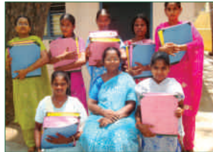
"We have successfully completed our training." Skills Training Center, Chittoor, Andhra Pradesh

In the last batch (24th batch), we were able to provide full-fledged 9-month training to 14 deserving women. After their training, these women could sew clothes for themselves and their families. Their training is now over and would be awarded certificates.