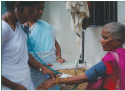
Geriatric Camp - Community Outreach Program DJM CM Hospital, Peyanapalli, Andhra Pradesh

regular rural based General Health-Dental, Eye and Geriatric Care Camps.