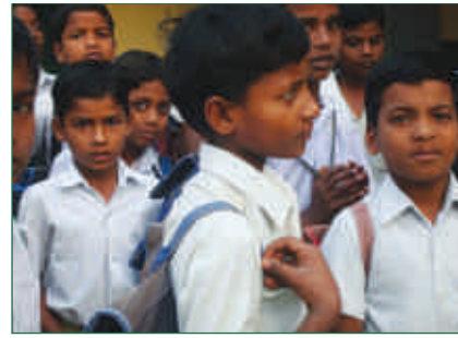
"Preparing to go to School" Beattie Memorial Boys School, Chittoor, Andhra Pradesh

In the entire academic year we had focused on children's academic education, physical and talent development activities. Our children have done fairly well in their studies.